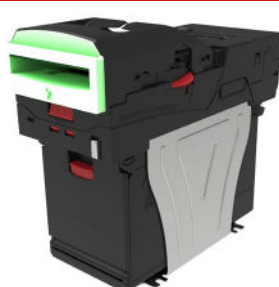
Horizontal 600 Slide