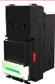
Vertical 300 Clip