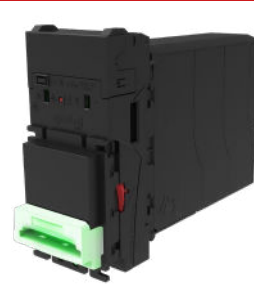
Vertical 1500 Clip